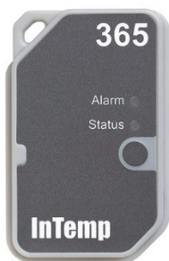
(CX503 model shown)

InTemp CX500 series loggers measure temperature in transportation monitoring applications. These Bluetooth® Low Energy-enabled loggers are designed for wireless communication with a mobile device and can be configured to monitor temperatures in Cold Chain, CRT, and Frozen shipments. CX500 series loggers, the InTemp app, and InTempConnect® web-based software work together to form the InTemp temperature monitoring solution. Using the InTemp app on your phone or tablet, you can configure CX series loggers and then download them to share and view logger reports, which include logged data, excursions, and alarm information. Or you can use InTempConnect to configure and download CX series loggers via the CX Gateway. The InTempVerify™ app is also available to easily download loggers and automatically upload reports to InTempConnect. Once logged data is uploaded to InTempConnect, you can view logger configurations, build custom reports, monitor trip information, and more. The CX500 series logger is available in a single-use 90-day model (CX502) or a multiple-use 365-day model (CX503).