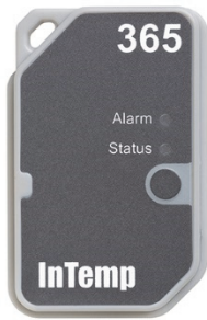
(CX503 model shown)

InTemp CX500 series loggers measure temperature in transportation monitoring applications. These Bluetooth® Low Energy-enabled loggers are designed for wireless communication with a mobile device and can be configured to monitor temperatures in Cold Chain, CRT, and Frozen shipments. CX500 series loggers, the InTemp app, and InTempConnect® web-based software work together to form the InTemp temperature monitoring solution. Using the InTemp app on your phone or tablet, you can configure CX series loggers and then download them to share and view logger reports, which include logged data, excursions, and alarm information. Or you can use InTempConnect to configure and download CX series loggers via the CX Gateway. The InTempVerify™ app is also available to easily download loggers and automatically upload reports to InTempConnect. Once logged data is uploaded to InTempConnect, you can view logger configurations, build custom reports, monitor trip information, and more. The CX500 series logger is available in a single-use 90-day model (CX502) or a multiple-use 365-day model (CX503).