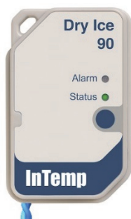
(CX602 model shown)

InTemp CX600 Dry Ice and CX700 Cryogenic loggers are designed for cold shipment monitoring and have a built-in external probe that can measure temperatures as low as -95°C (-139°F) for the CX600 series or -200°C (-328°F) for the CX700 series. The loggers include a protective sheath to prevent cutting the cable during shipment and a clip for mounting the probe. Designed for wireless communication with a mobile device, these Bluetooth® Low Energy-enabled loggers use the InTemp app, and InTempConnect® web-based software to form the InTemp temperature monitoring solution. Using the InTemp app on your phone or tablet, you can configure the loggers and then download them to share and view logger reports, which include logged data, excursions, and alarm information. Or, you can use InTempConnect to configure and download CX series loggers via the CX5000 Gateway. Once logged data is uploaded to InTempConnect, you can view logger deployments, build custom reports, monitor trip information, and more. Both the CX600 and CX700 series loggers are available in single-use 90-day models (CX602 and CX702) or multiple-use 365-day models (CX603 or CX703).