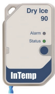
(CX602 model shown)

InTemp CX600 Dry Ice and CX700 Cryogenic loggers are designed for cold shipment monitoring and have a built-in external probe that can measure temperatures as low as -95°C (-139°F) for the CX600 series or -200°C (-328°F) for the CX700 series. The loggers include a protective sheath to prevent cutting the cable during shipment and a clip for mounting the probe. Designed for wireless communication with a mobile device, these Bluetooth® Low Energy-enabled loggers use the InTemp app, and InTempConnect® web-based software to form the InTemp temperature monitoring solution. Using the InTemp app on your phone or tablet, you can configure the loggers and then download them to share and view logger reports, which include logged data, excursions, and alarm information. Or, you can use InTempConnect to configure and download CX series loggers via the CX5000 Gateway. The InTempVerify™ app is also available to easily download loggers and automatically upload reports to InTempConnect. Once logged data is uploaded to InTempConnect, you can view logger configurations, build custom reports, monitor trip information, and more. Both the CX600 and CX700 series loggers are available in single-use 90-day models (CX602 and CX702) or multiple-use 365-day models (CX603 or CX703).