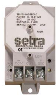
Setra Differential Pressure Transducer