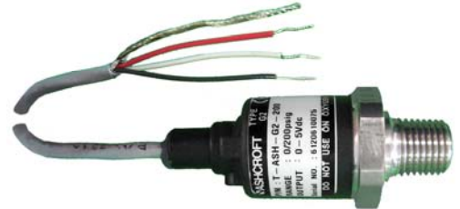
Ashcroft Pressure Transducer

This document provides instructions on connecting the Ashcroft Pressure Transducers listed above to either the FlexSmart™ Analog Module used with HOBO H22 series data loggers or to the Analog Sensor Port option used with HOBO U30 series loggers. It also lists configuration values used by HOBOWare® Pro software to configure the logger for each transducer. Note: For information on connecting the pressure transducer to the pressure source, and other transducer details, refer to the documentation provided by Ashcroft.